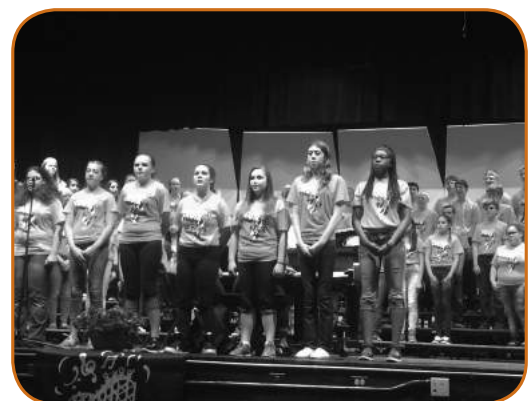
Grants in Action