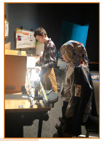
LEO Program ALC

2019 Weinman Fund Elementary Author Visit