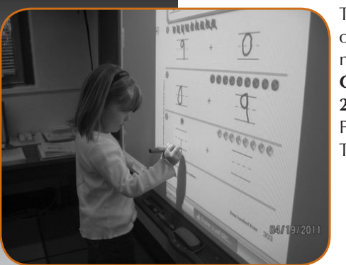
25 new Smart Boards were funded at the Gala!

next year's "Denim & Diamonds Gala" to be held March 3, 2012. Proceeds will benefit the Foundation and our WAPS Technology Intitiative.